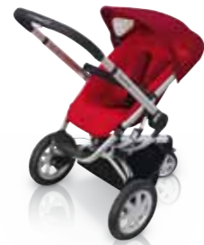
Forward and rearward facing reclinable seat