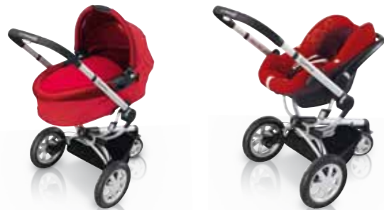
Travel system option with Buzz Dreami carrycot and Maxi-Cosi infant car seat or Bébé Confort Pebble car seat (adapters included)

Quinny Buzz Dreami carrycot: until 9 kg Maxi-Cosi / Bébé Confort Pebble infant car seat: until 13 kg Pushchair seat: until 15 kg