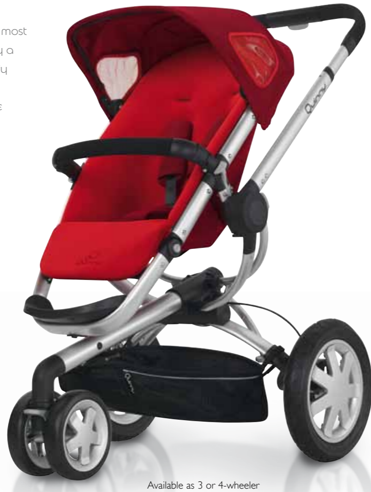
Available as 3 or 4-wheeler

The Quinny Buzz cleverly unfolds automatically into the most complete pushchair available. With the flexibility to carry a car seat or a carrycot and coming complete with a comfy seat, it's the ultimate combination of comfort for children (from birth to toddler) and ease of use, that lets them live their life, their way.