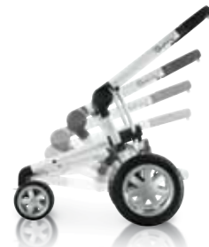
Unique gaspring for 'automatic' unfolding frame